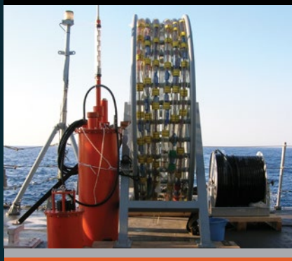
Oil filled array

The system may be supplied with the following array types: